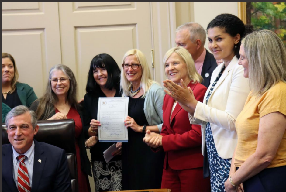
Lieutenant Governor Hall-Long joins Governor Carney, legislative sponsors, and advocates for the bill signing of HB 33, which will increase funding for preschool students with disabilities

Ensuring that all of Delaware's youngest learners have what they need to achieve success in school and in life is critical to the success of our state.