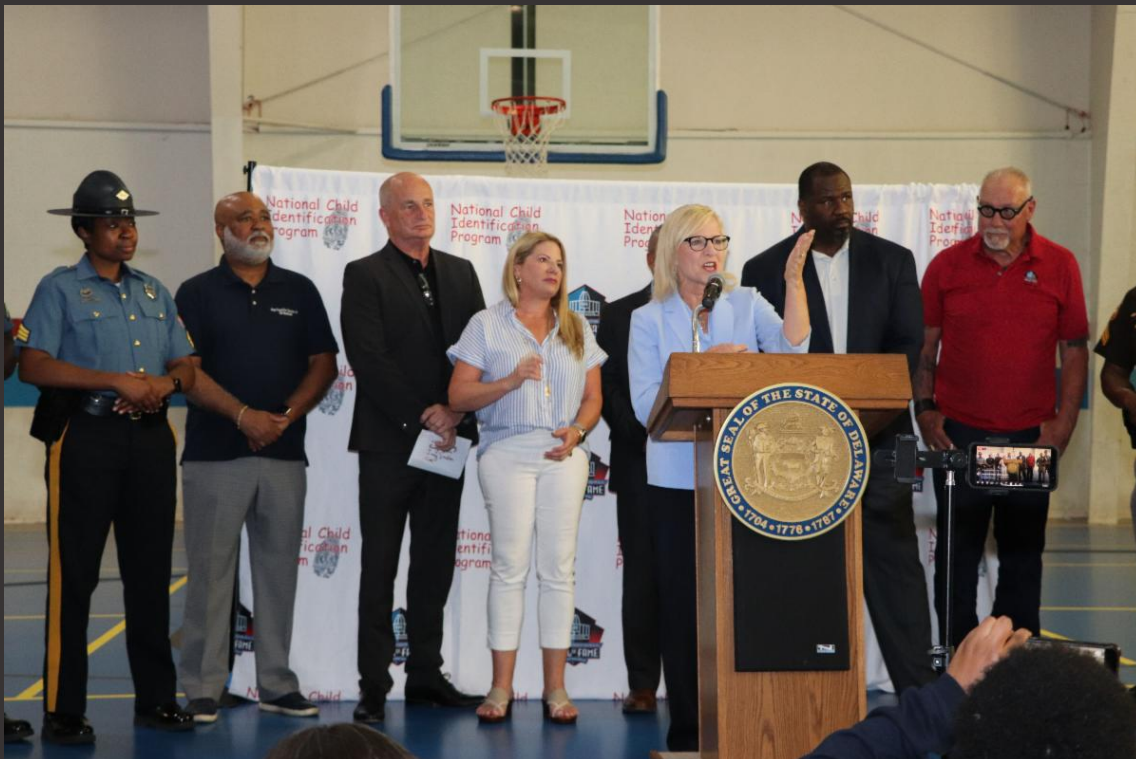
Lt. Governor Hall-Long pictured with NFL legends, state legislators, law enforcement leaders and advocates to announce the National Child ID Program in Delaware