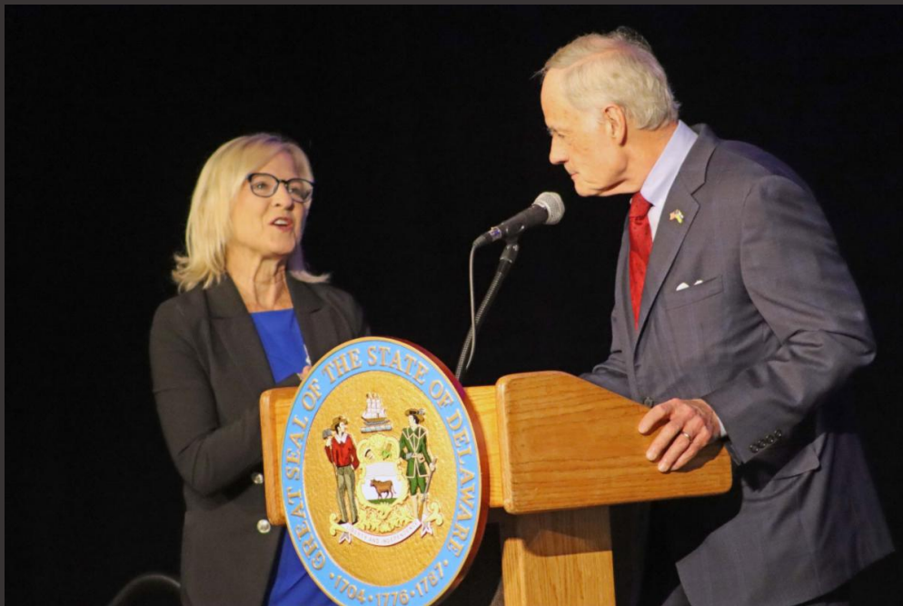
U.S. Senator Tom Carper (D-Del) joins Lt. Governor Hall-Long on stage to open Monday's Mental and Behavioral Health Summit

Several of Delaware's elected leaders joined Lt. Governor Hall-Long for portions of Monday's summit. U.S. Senator Tom Carper helped open the event with remarks focused on the importance of improving mental health resources and the work being done in Congress to expand access to care for those in need. “Monday’s event is an important step forward in addressing the mental and behavioral health needs of Delawareans,” said U.S. Senator Tom Carper